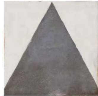
*20205 MAISON DECOR Q6 (22,3x22,3 cm — 8 3 / 4 x8 3 / 4 ") 6 patterns