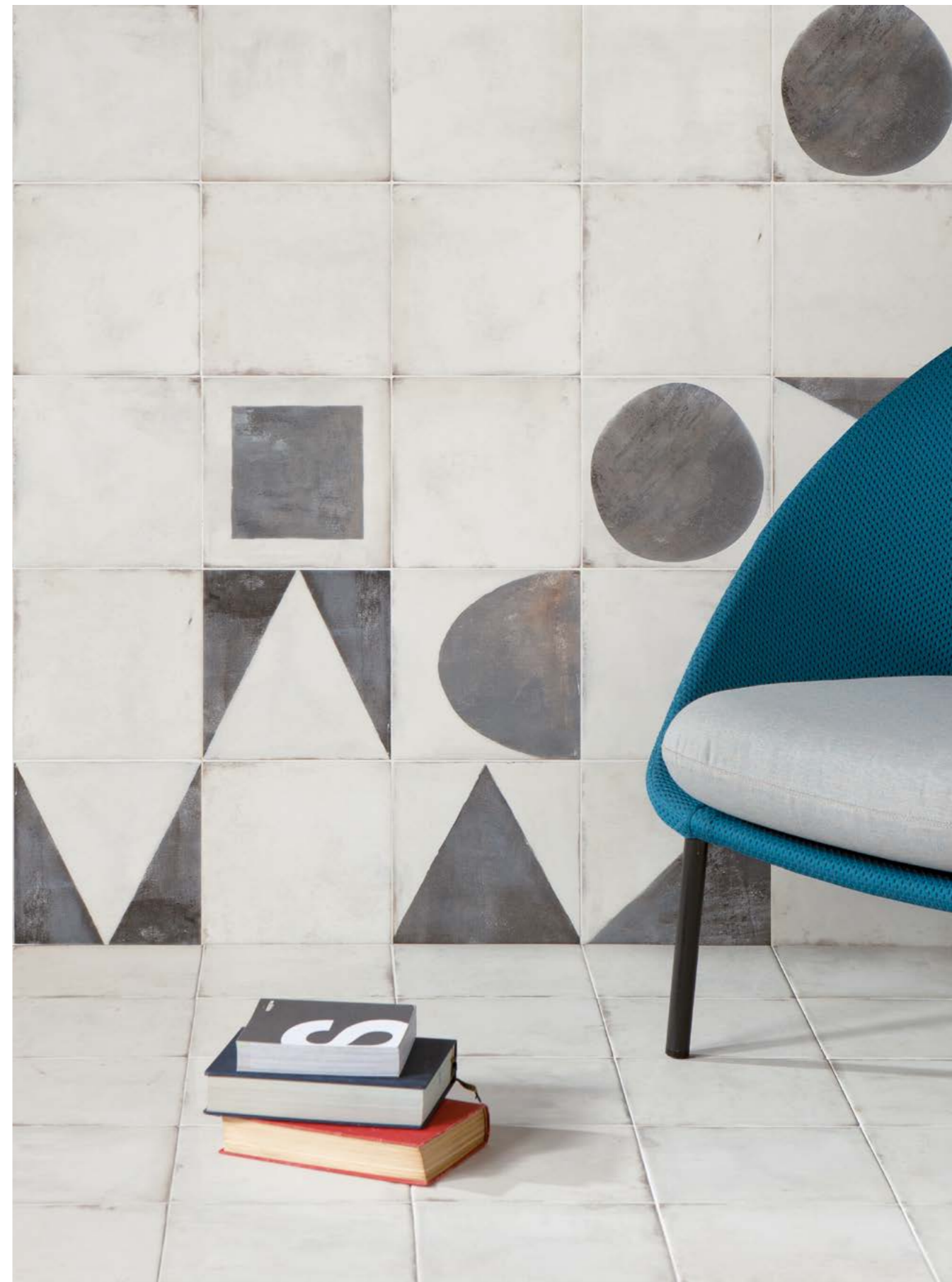
MAISON PLAIN · MAISON DECOR

Colección del diseñador de interiores y mobiliario Francisco Segarra para HARMONY. MAISON by ONSET toma como referencia la cerámica envejecida y la lleva a la alta decoración de venta por metro cuadrado. Su base de tonalidad blanca con aspecto desgastado, se combina con el decorado geométrico que combina la base con motivos grises. Triángulos, círculos y cuadrados que combinados entre sí aportan un resultado novedoso y fresco en el mundo de la decoración.