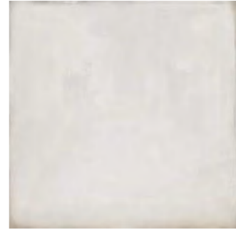
20204 MAISON PLAIN Q6 (22,3x22,3 cm — 8 3 / 4 x8 3 / 4 ") 10 patterns