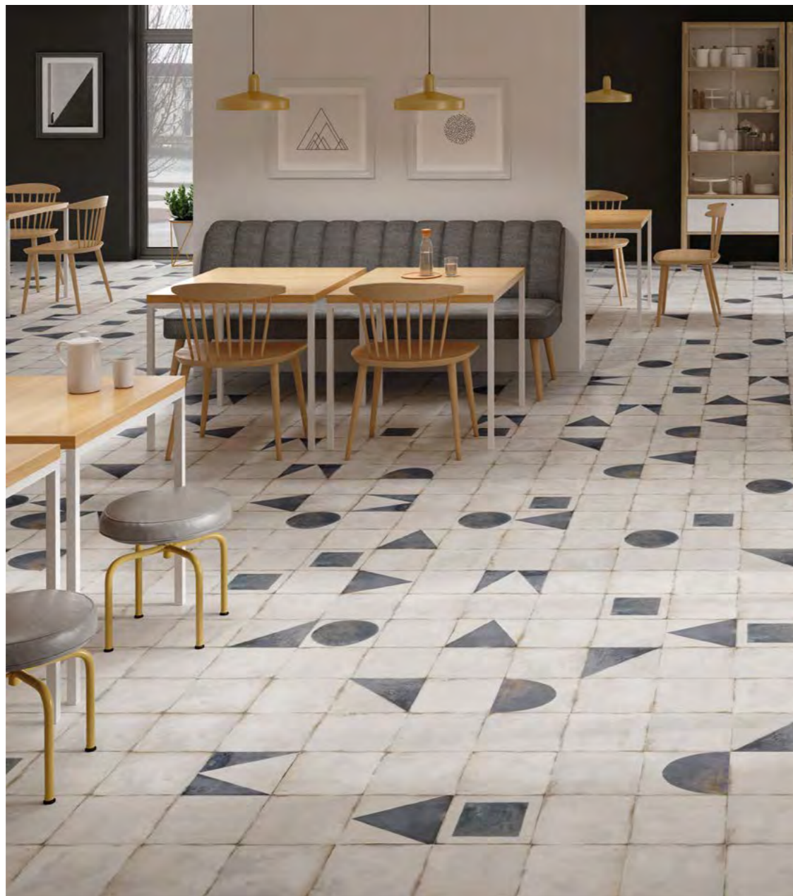
MAISON PLAIN · MAISON DECOR

Collection by furniture and interior designer Francisco Segarra for HARMONY. This porcelain tile collection has transformed aged looking ceramic tiles into a chic upper class design tool. Sold by the square metre, the collection's white field tiles have a worn-looking charm. They can be combined with geometrically patterned decors featuring the same white background and triangles, circles or squares. By mixing and matching the different shapes, innovative new design effects can be achieved.