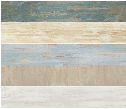
R10 JAIPUR MULTI 15 X 90 / 6" X 36"