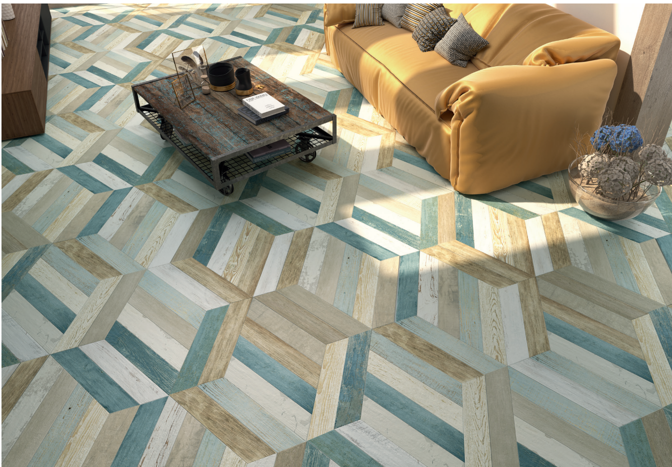
CHEVRON JAIPUR MULTI 9,8X46,5.