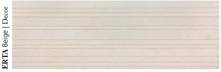
ERTA Beige | Decor