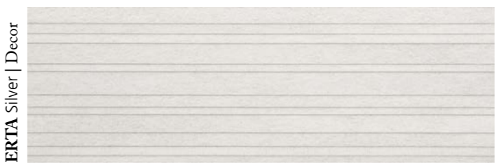
ERTA Silver | Decor