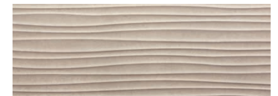
● At.Mist Duna Tortora 25x70 M08 2.185.297.3696 ●