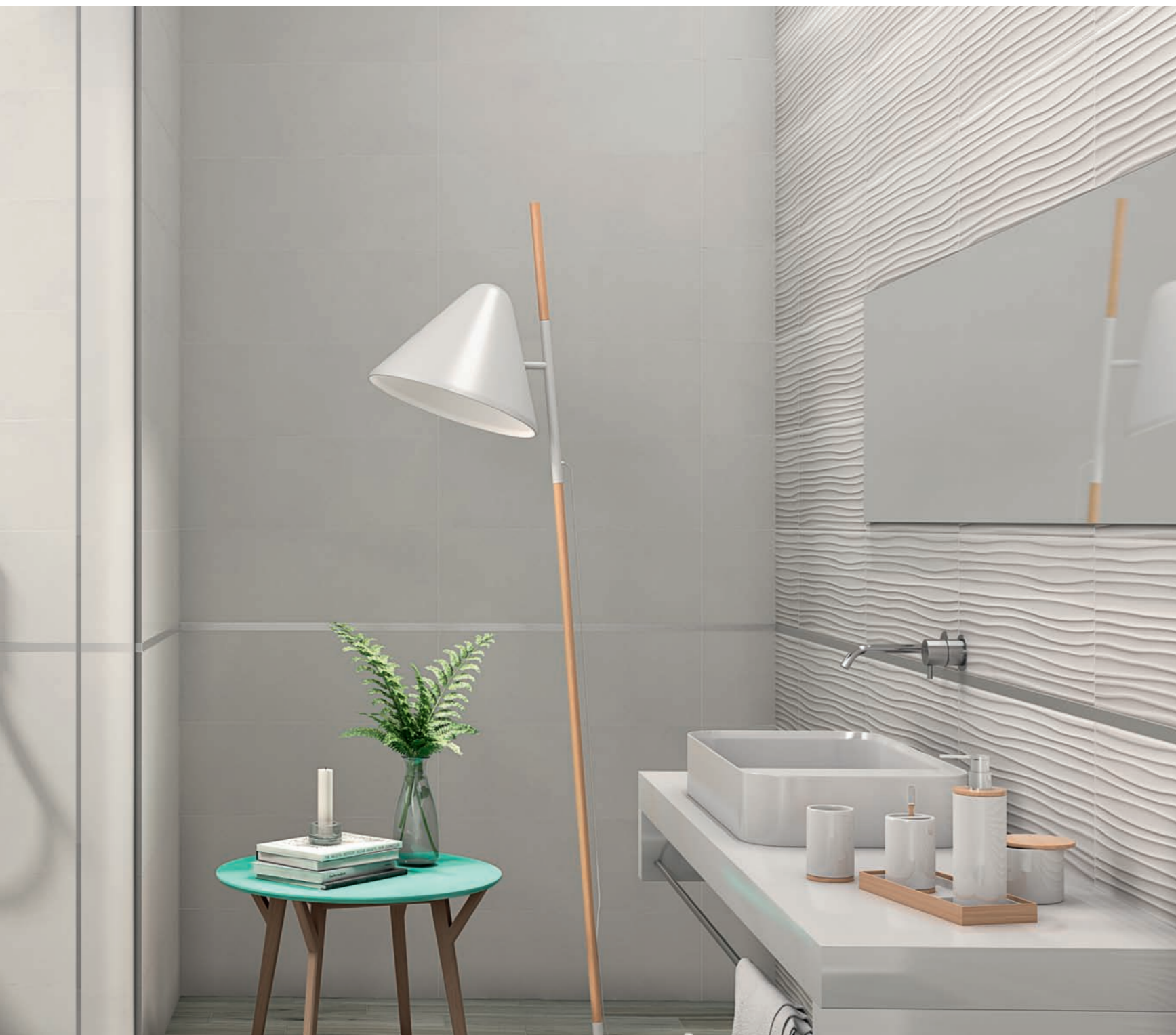
Rvto. / Wall / Rvfm.: At. Mist Light 25x70 - At. Mist Duna Light 25x70