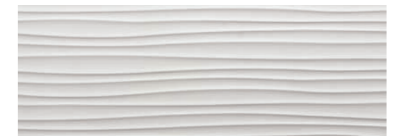
● At.Mist Duna Light 25x70 M08 2.185.204.3696 ●