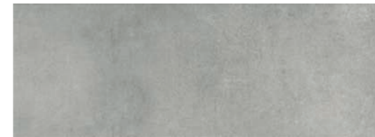
● At.Mist Perla 25x70 M08 2.185.37.3679 ●