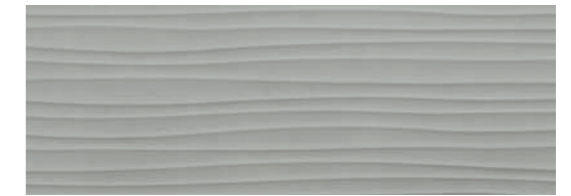
● At.Mist Duna Perla 25x70 M08 2.185.37.3696 ●