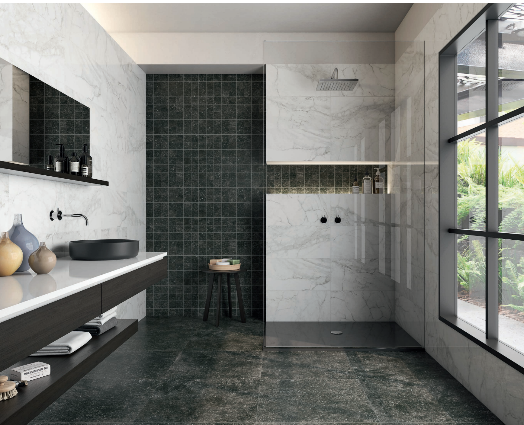
Rvto. / Wall / Rvto.: Luni Blanco 30x60 Leviglass, Malla Cr. Belgio Negro 30x30 (7x7) Compactto Pedra Pvto. / Floor / Sol: Cr. Belgio Negro 60x60 Compactto Pedra