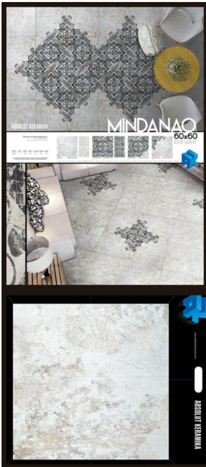
PE MINDANAO 60X60 80X180