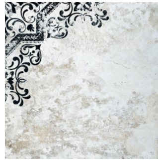
MINDANAO TERM 02 B31