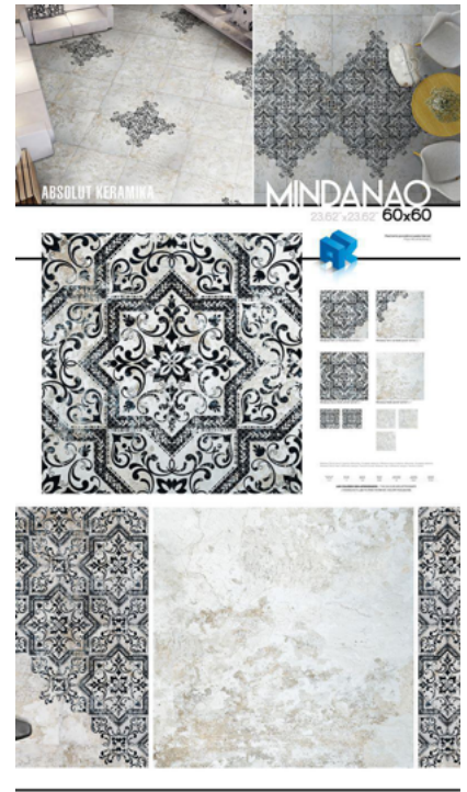
PT MINDANAO 60X60 (100.5X192.5)