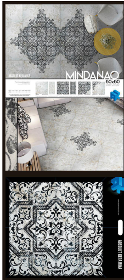
PE MINDANAO DECOR 60X60 (80X180)