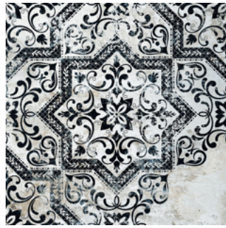
MINDANAO TERM 01 B31