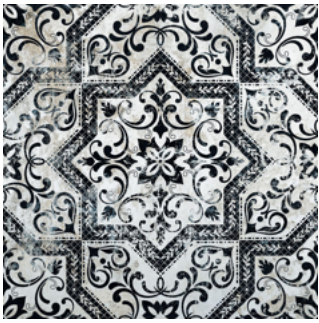
MINDANAO DECOR B31