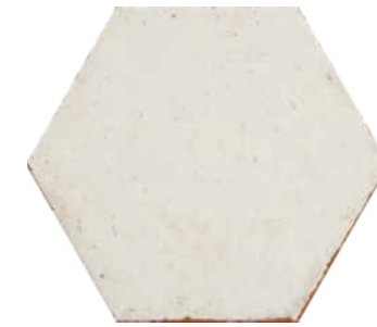
19436 ANDAMAN PLAIN Q1 (24,8x28,5 cm) (9 3/4 x11 1/4 *) 3 patterns