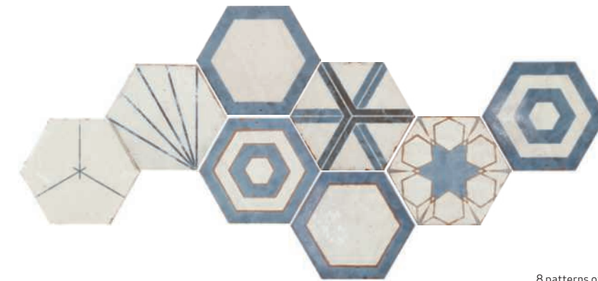
*Random designs in box. Diseños aleatorios por caja.