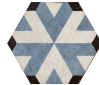
*19437 ANDAMAN DECOR Q1 (24,8x28,5 cm) (9 3/4 x11 1/4 *) 9 patterns