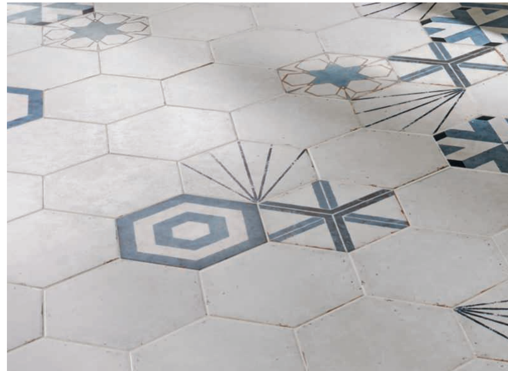
ANDAMAN PLAIN/28,5 · ANDAMAN DECOR/28,5

Worn-looking hexagonal porcelain floor tiles with a trend-setting vintage appeal, featuring geometrical patterns in shades of grey on the field tiles and blue on the décors. Because these are porcelain tiles, ANDAMAN's multiple collections and geometries can be used on both walls and floors.