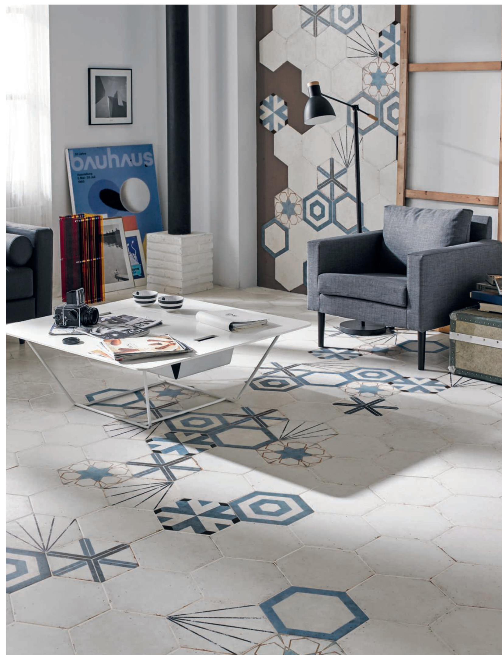
ANDAMAN PLAIN/28,5 · ANDAMAN DECOR/28,5

Su estética totalmente a la vanguardia de las tendencias vintage, se traduce en un pavimento de gres hexagonal de aspecto desgastado y decoraciones geométricas que combinan los tonos grises en la base y los azules en la decoración. El material en el que está fabricado permite jugar con su geometría y sus múltiples colecciones en pared y suelo.