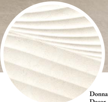
Donna Sand Decor_33,3*100