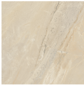
AUSTRALIAN CREMA 60.8 X 60.8 / 24'' X 24''