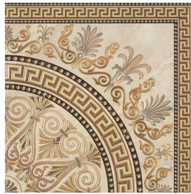
ROSETON NARON 60.8 X 60.8 / 24'' X 24''