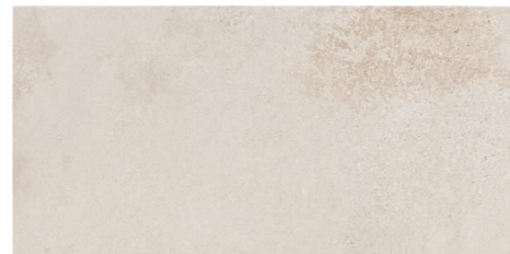
PEI 4 ● At. Choice Sand 30,3x61,3 M19 015.722.0119.04333 ● At. Choice Sand 45x45 M15 015.340.0119.04333