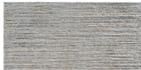
● At. Rlv. Choice Zircon 30,3x61,3 M19 015.722.0139.04372