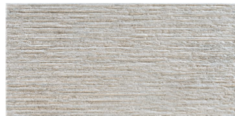
● At. Rlv. Choice Ash 30,3x61,3 M19 015.722.0344.04372