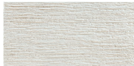
● At. Rlv. Choice Light 30,3x61,3 M19 015.722.0204.04372