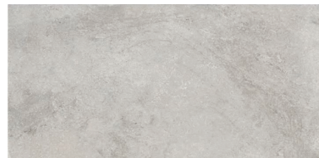
PEI 4 ● At. Choice Ash 30,3x61,3 M19 015.722.0344.04333 ● At. Choice Ash 45x45 M15 015.340.0344.04333