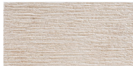
● At. Rlv. Choice Sand 30,3x61,3 M19 015.722.0119.04372