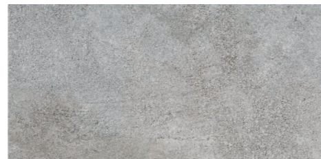
PEI 4 ● At. Choice Zircon 30,3x61,3 M19 015.722.0139.04333 ● At. Choice Zircon 45x45 M15 015.340.0139.04333