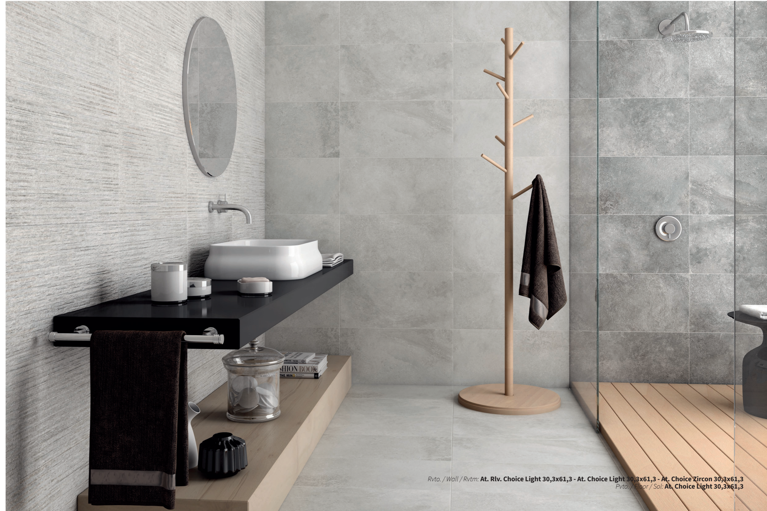
Rvto. / Wall / Rvrm: At. Rlv. Choice Light 30,3x61,3 - At. Choice Light 30,3x61,3 - At. Choice Zircon 30,3x61,3 Pvto. / Floor / Sol: At. Choice Light 30,3x61,3