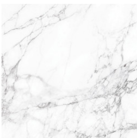
CAPRAIA GOLD PUL RECT G.192 | Porcelain tiles | Polished | Neutral Body Rectified.