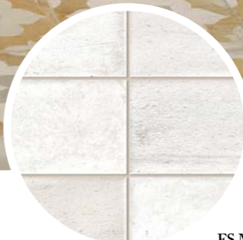
FS Mud White