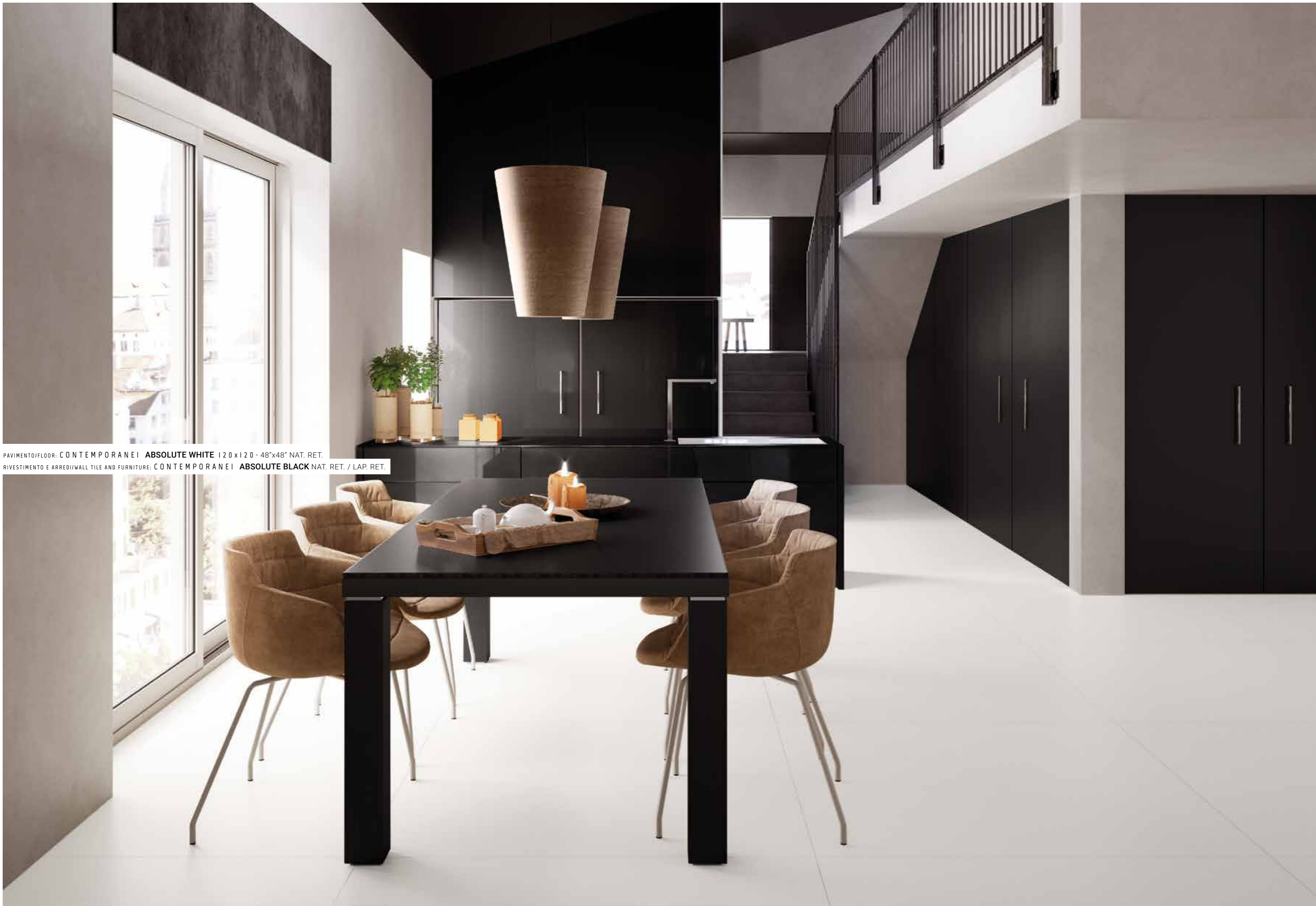
PAVIMENTO/FLOOR: CONTEMPORANEI ABSOLUTE WHITE 120 x 120 - 48"x48" NAT. RET. RIVESTIMENTO E ARREDI/WALL TILE AND FURNITURE: CONTEMPORANEI ABSOLUTE BLACK NAT. RET. / LAP. RET.