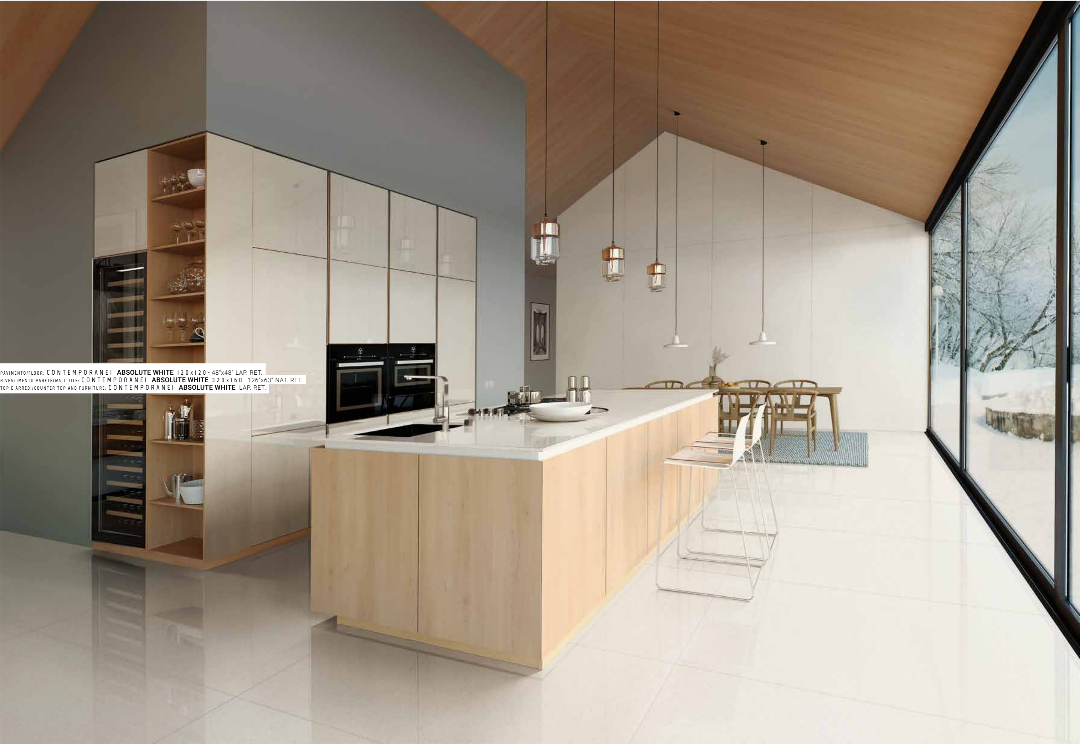
PAVIMENTO/FLOOR: CONTEMPORANEI ABSOLUTE WHITE 120 x 120 - 48"x48" LAP. RET. RIVESTIMENTO PARETE/WALL TILE: CONTEMPORANEI ABSOLUTE WHITE 320 x 160 - 126"x63" NAT. RET. TOP E ARREDI/COUNTER TOP AND FURNITURE: CONTEMPORANEI ABSOLUTE WHITE LAP. RET.