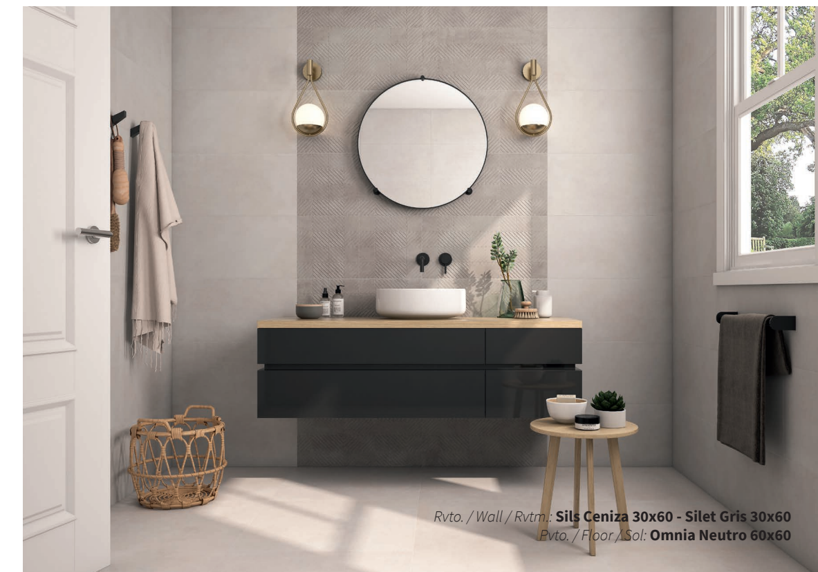
Rvto. / Wall / Rvtrn.: Sils Ceniza 30x60 - Silet Gris 30x60 Rvto. / Floor / Sol.: Omnia Neutro 60x60

• Silet Gris 30x60 Rec. M26 031.547.0002.08919